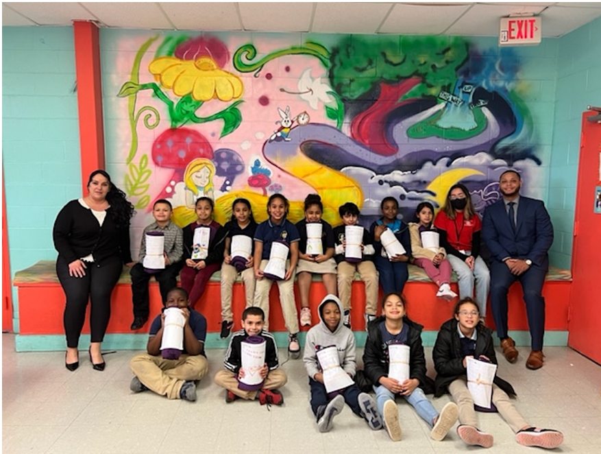
Boys & Girls Club in Garfield, NJ with Blankets of Hope to be Delivered to Center for Hope and Safety, Rochelle Park, NJ.